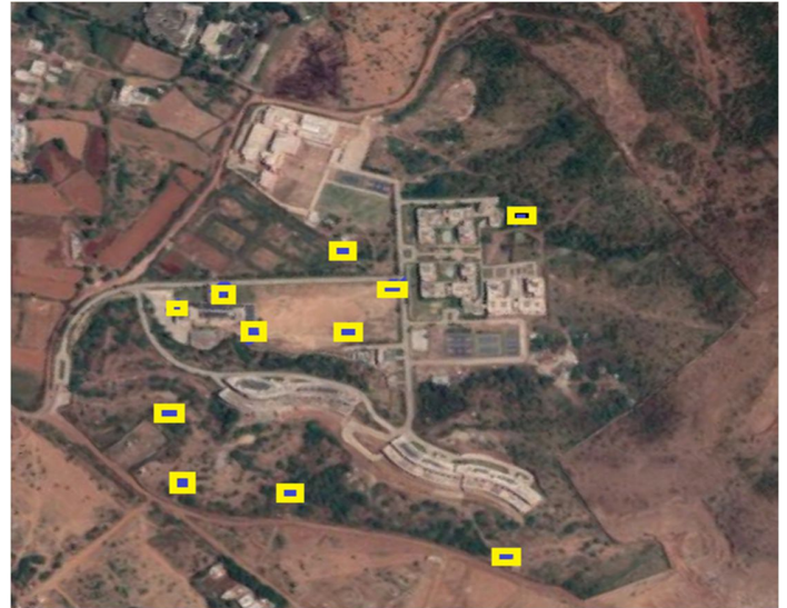
Rainwater Harvesting Pits Locations

This has also been appreciated by Hon'ble High Court Gwalior MP Local Newspaper.