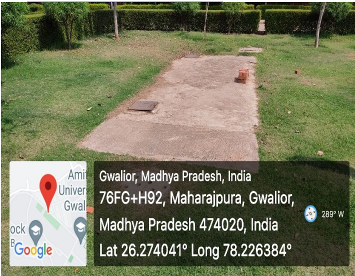
Rainwater Harvesting System